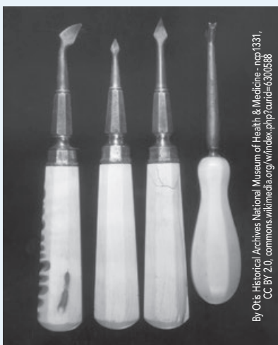
Paul Revere's dental tools.

The National Museum of Health and Medicine calls Revere's deed "one of the earliest cases of forensic evidence used to identify a fallen American soldier." Paul Revere — patriot, artisan, and forensic odontologist.